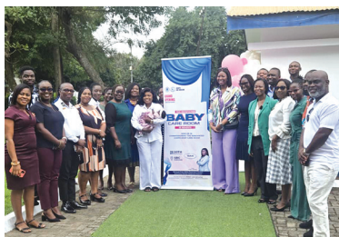
SRC Commissions Baby Care Room to Support Student-Parents at GIMPA