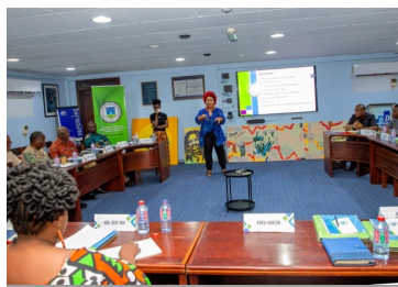
The GIMPA Journey - Creative Arts Degree Program

GHANA INSTITUTE OF MANAGEMENT AND PUBLIC ADMINISTRATION (GIMPA)