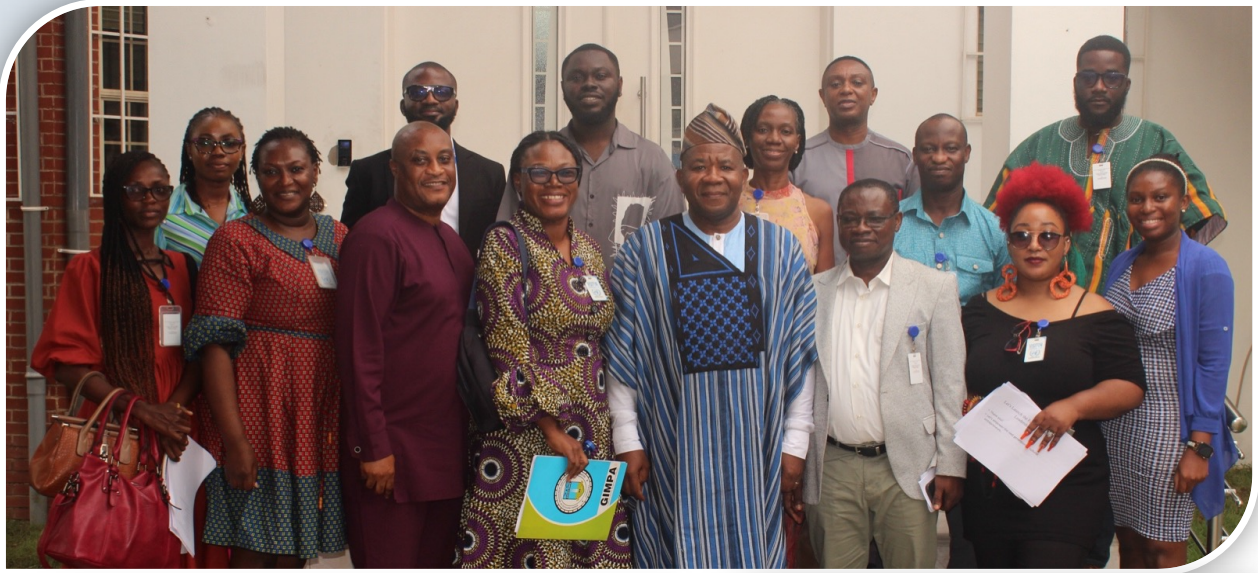
table. Through these discussions, we sought to understand current industry demands, trends, and opportunities that a robust curriculum must address. These initial conversations were instrumental in aligning our program's objectives with the pressing needs and aspirations of the arts community.

This is where we floated the initial idea to receive critical inputs and directions for the programme design. We began with a series of enlightening engagements with key creative arts stakeholders who bring diverse perspectives and invaluable insights to the